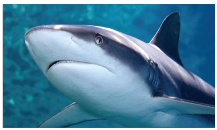
Alternative ageing method still needed for sharks and relatives

Six species were used: the Port Jackson shark; piked spur-dog; southern fiddler ray; sparsely spotted stingaree; thornback skate; and the elephant shark. Telomeres were also measured in a species of teleost