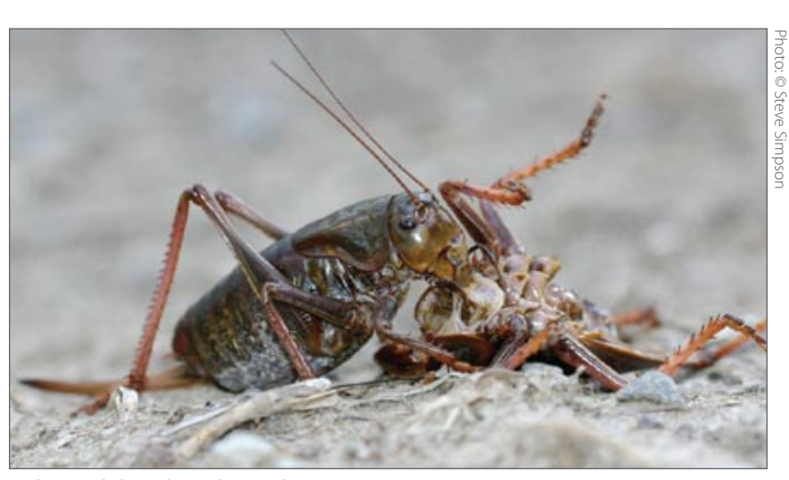
Cricket cannibalism: Clues to human obesity?

for his leadership in advancing quantum computing research.