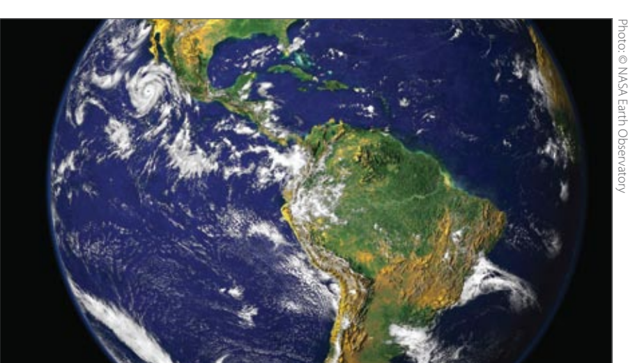
Earth observation: On the agenda for space science

More information on the draft Decadal Plan for Australian Space Science can be found at www.physics.usyd.edu.au/~ncss/