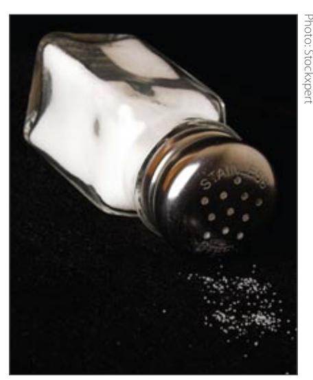
lodised salt: A simple solution to iodine deficiency

The statement lodine deficiency in Australia: A call for action by the National Committee for Nutrition is available from www.science. org.au/natcoms/iodine.htm