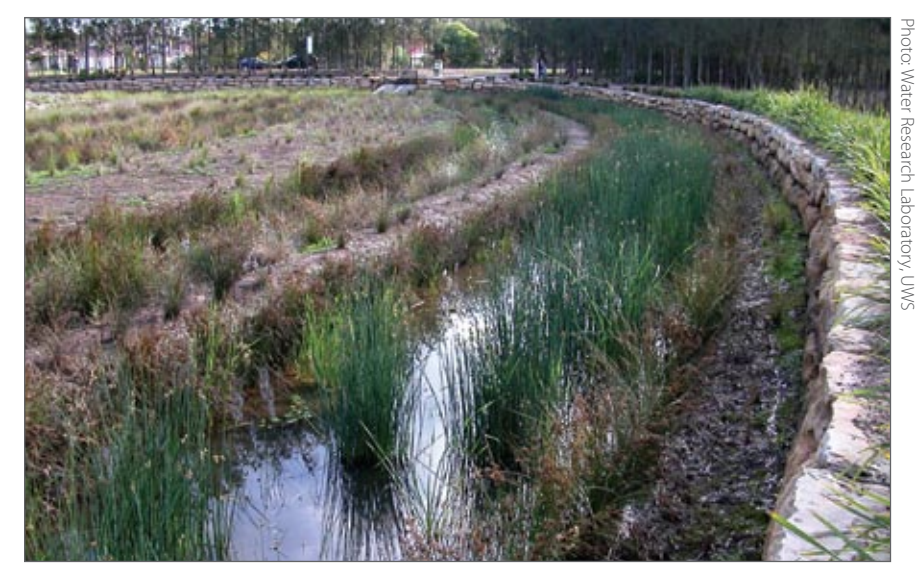
Biofiltration: Using nature to clean up stormwater

This topic is sponsored by the Australian Research Council Linkage Learned Academies Special Projects Grant (www.arc.gov.au/ncgp/lasp/lasp_default.htm). The Australian Foundation for Science is also a supporter of Nova .