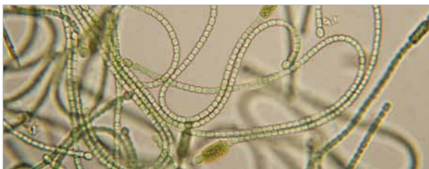
Cyanobacteria brought about the oxygenation of the Earth's atmosphere