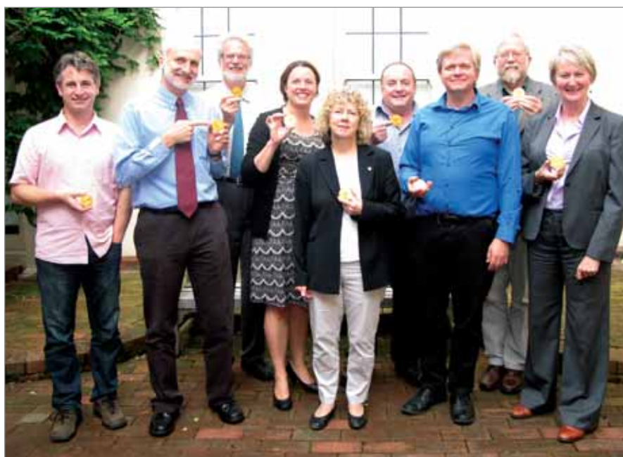
All winners — the Astronomy National Committee with chocolate Nobel Prize medals