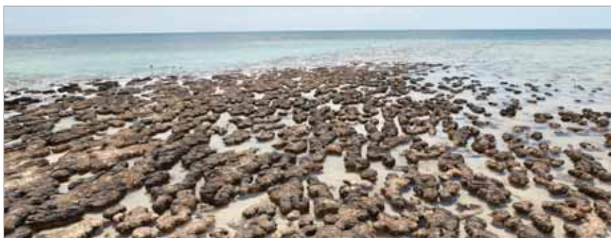
Stromatolites at Shark Bay, Western Australia

The evolution of cyanobacteria brought about one of the most revolutionary changes in Earth history, the beginning of oxygenation of the atmosphere and hydrosphere. Earth's atmosphere probably became oxygenated by 2.4 billion years ago, but geological evidence suggests that there were cyanobacteria hundreds of millions of years earlier. We are now looking for reliable markers of their presence in ancient rocks.